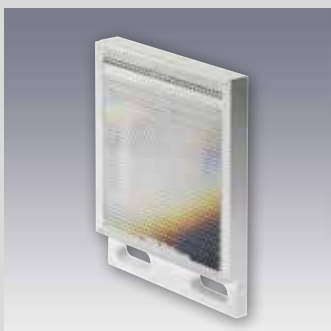
Versatile: Sensopart offers a comprehensive selection of reflectors and reflective tape: rectangular, square or round.