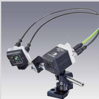
Flexible: MG 3A Mounting angle with 3 axes and drilled hole for mounting rod.