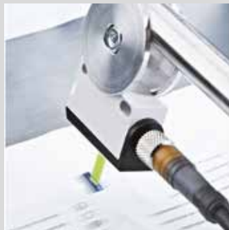
Practical: sensors can be comfortably and precisely aligned after mounting with the help of rod brackets.