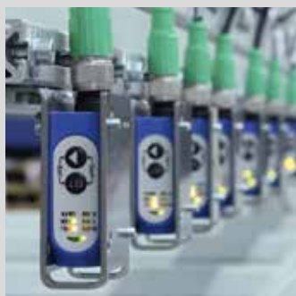
Robust: all mounting and bracket elements are extremely stable and offer additional protection for sensors when necessary.